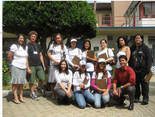
Survey interns get ready to hit the streets.