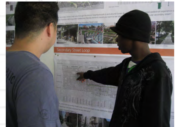
Residents learn about a proposed plan at a community workshop.