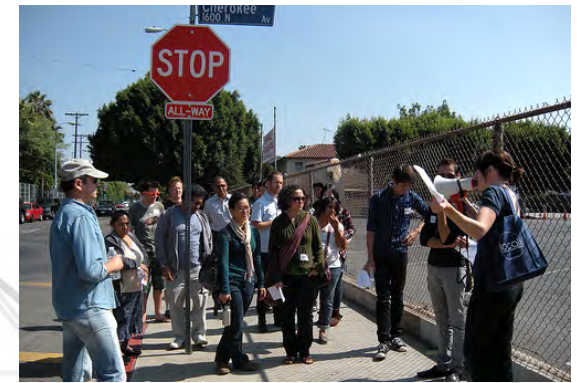
An HCS staff member leads community members on a field trip about green development.