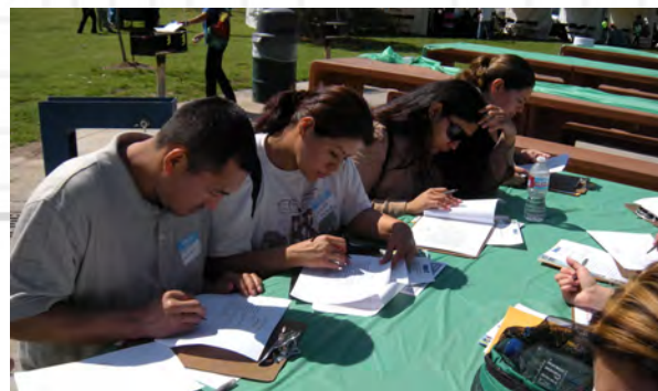
Residents take our survey.