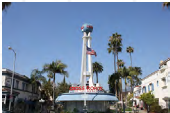
HCS is in the Crossroads of the World complex.

The Hollywood Community Studio (HCS) is a community-based research project that studies the physical and social changes taking place in Hollywood. HCS helps coordinate investments in place and investments in people by linking local residents and small businesses with the opportunities that arise from redevelopment (like access to new jobs and housing). HCS specializes in research and outreach initiatives to gain a better understanding of what the community needs and then shares these results with local decision makers to influence the future direction of Hollywood. HCS is supported by the Community Redevelopment Agency of the City of Los Angeles, and works closely with the Thai Community Development Center, the Hollywood Community Housing Corporation, and LA Voice to carry out its work in Central Hollywood.